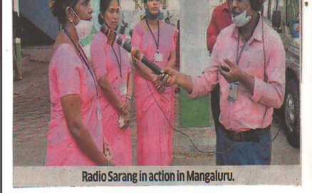
Radio Sarang in action in Mangaluru.

More than all this, Sarang's best testimonial comes from its listeners, who call it 'Namma Radio'.