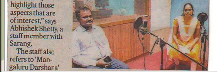
Recording underway at the Sarang studio.

The staff also refers to 'Mangaluru Darshana'