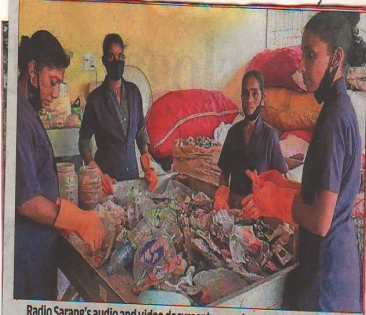
Radio Sarang's audio and video documentary, on how waste is segregated under 25 different categories, has reached out to a wider audience.