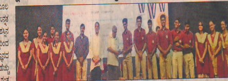
ವಿಶೇಷ ತಂಡದ ಸದಸ್ಯರು ಬಹುಮಾನ ಸ್ವೀಕರಿಸಿದರು.

ಮುಖಾಂತರ, ಫೆ. 1: ಮೂಲ ವಿಜ್ಞಾನ ಪ್ರತಿಭೆ ಹೆಚ್ಚಿಸಲು ಅನುಕೂಲವಾಗಿ ಹಾಗೂ ಯಶಸ್ವಿ ದಾರಿಯನ್ನು ಹಿಡಿದು, ಅಭಿವೃದ್ಧಿ ಪಡಿಸುವ ಮೂಲ ವಿಜ್ಞಾನ ಅಭಿವೃದ್ಧಿ ಯೋಜನೆಗೆ ಹೆಚ್ಚಿನ ಆಸಕ್ತಿ ತೋರಿಸಲು ಎಂದು ಸರ್ಕಾರ ಅಧಿಕಾರಿಯು ಕಾಲೇಜಿನ ರಾಜ್ಯಾಂತರ ಕಾರ್ಯಕ್ರಮದ ಉದ್ಘಾಟನೆಯಲ್ಲಿ ಹೇಳಿದರು.